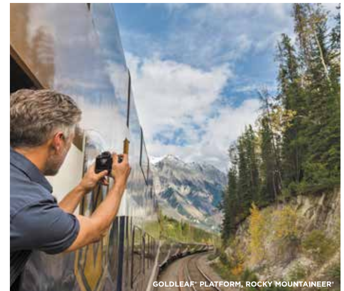
GOLDLEAF® PLATFORM, ROCKY MOUNTAINEER®