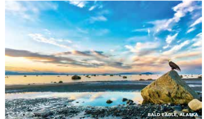
BALD EAGLE, ALASKA