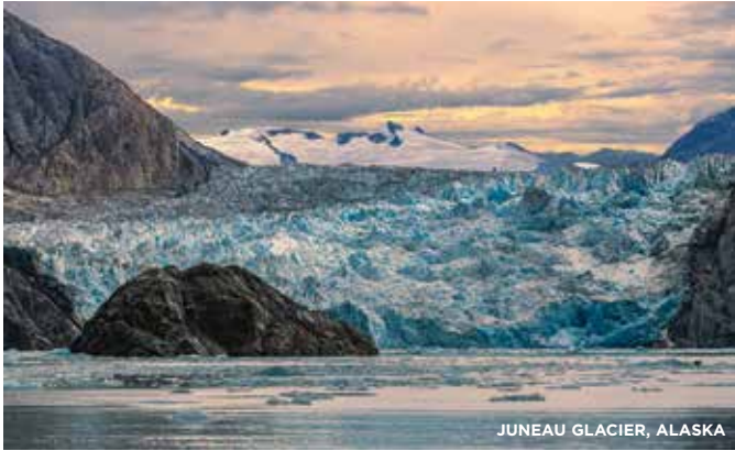
JUNEAU GLACIER, ALASKA