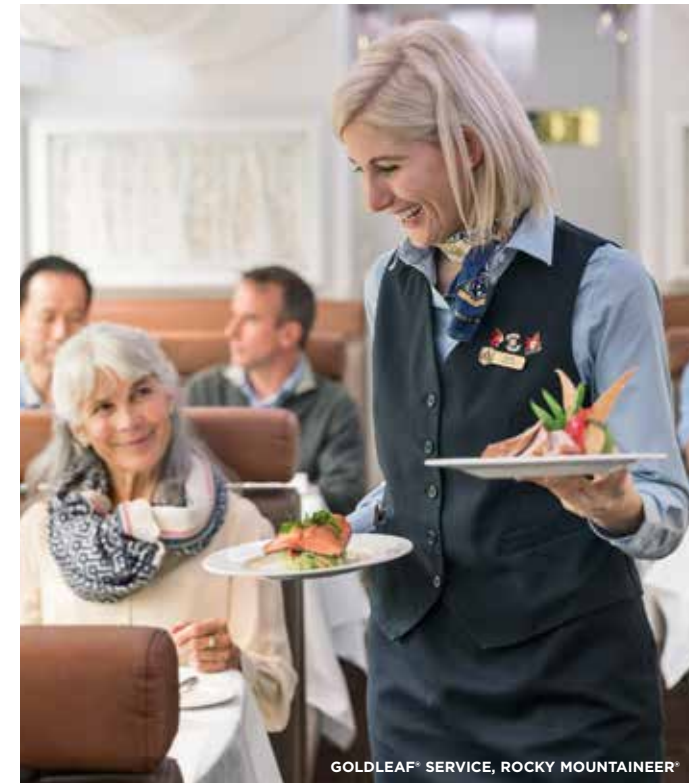
GOLDLEAF® SERVICE, ROCKY MOUNTAINEER®